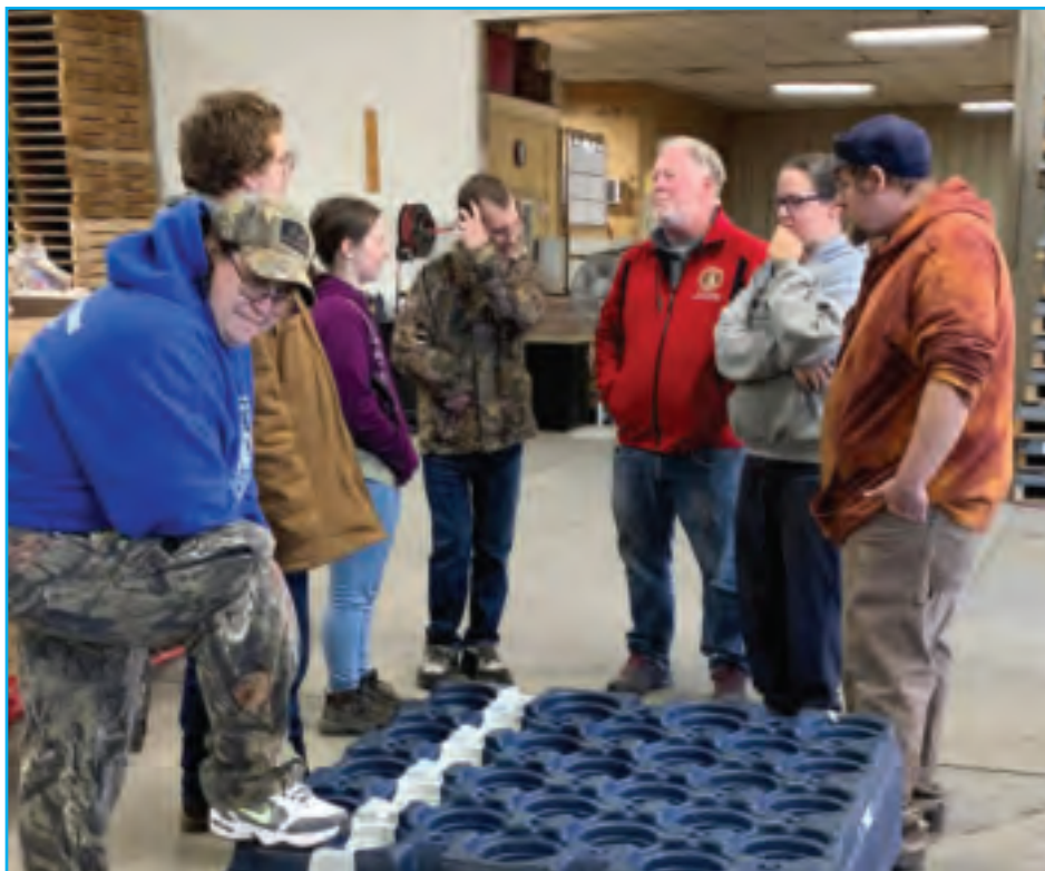
Workshop services include contracts with individual businesses which include everything from small local firms to national corporations.

It's a formula that is a proven winner for Missouri and Missourians.